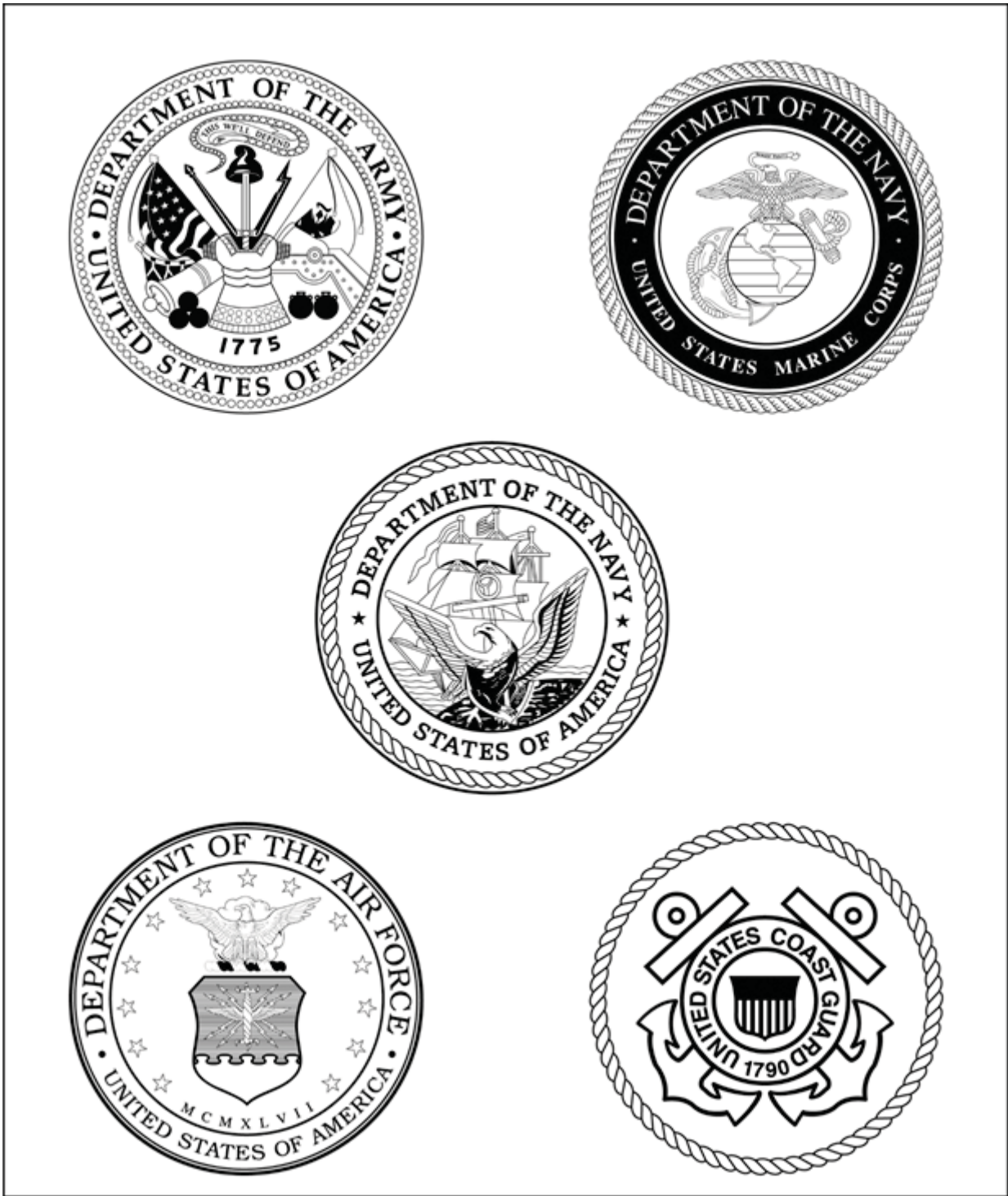
Figure E-1. Illustrations of military emblems