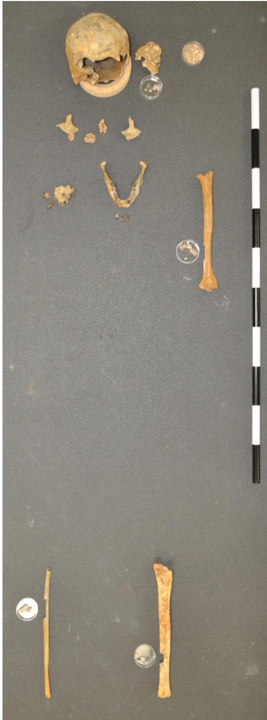
Figure 1. CIL 2014-125-I-01, skeletal layout. Scale in decimeters.